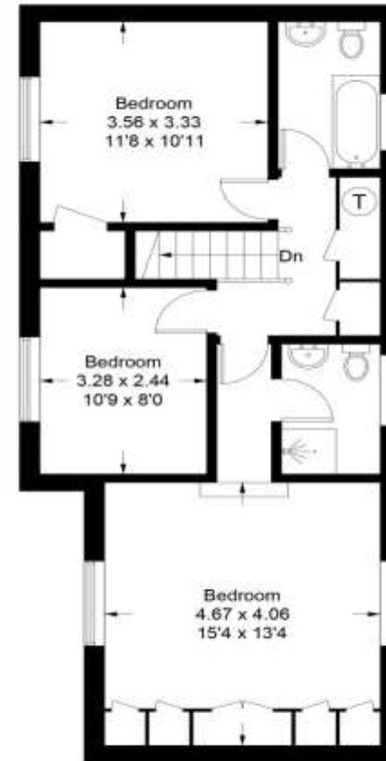
First Floor Sq ft 639

Illustration for identification purposes only, measurements are approximate, not to scale. FloorplansUsketch.com © 2024 (ID1108766)